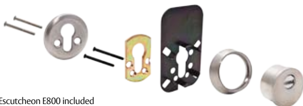
Escutcheon E800 included

NOTE: It is possible to manufacture backset 60 mm.